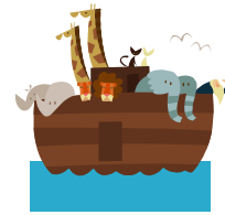
Water and the Word

Pastor Kathy continues our weekly chapel with the theme of water. We have covered baptism, the baptism of