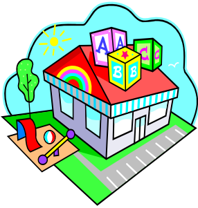
St. Stephen's Lutheran Church and Preschool

Our webmaster has been hard at work! Check out our updated website! While you're there, click on the link "insiderpages.com". We would love to have you rate us and write a review!